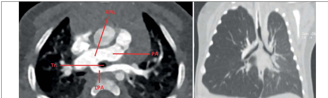
Fig. 3. Pulmonary artery sling: RPA — right pulmonary artery; PA — pulmonary artery; LPA — aberrant left pulmonary artery; Tr. — trachea

combination of an aberrant left subclavian artery, a Kommerell's diverticulum and persisting ductus arteriosus or ductal ligament enclose the lateral side and form a VR which may lead to symptomatic esophageal or tracheal compression. Kommerell's diverticulum is dangerous because of the possibility of its spontaneous rupture [5,21,23].