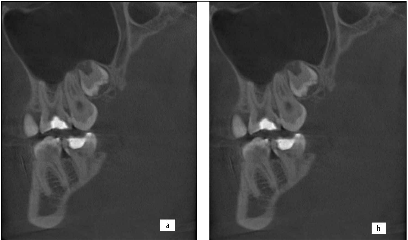
Fig. 3. a. Postoperative radiograph image of 2.6 tooth after the pulp capping with a calcium hydroxide in a month; b. Recall radiograph in a year of 2.6 tooth

tissues. In the period from 6 to 12 months in all clinical cases the formation of a dentinal bridge and complete repairing of dentin structure were identified (Fig. 2).