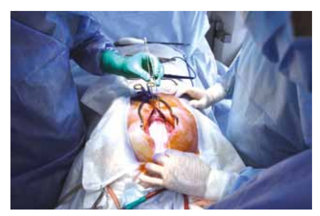
Fig. 3. The final stage of surgery. Drainage and tamponade of the residual cavity