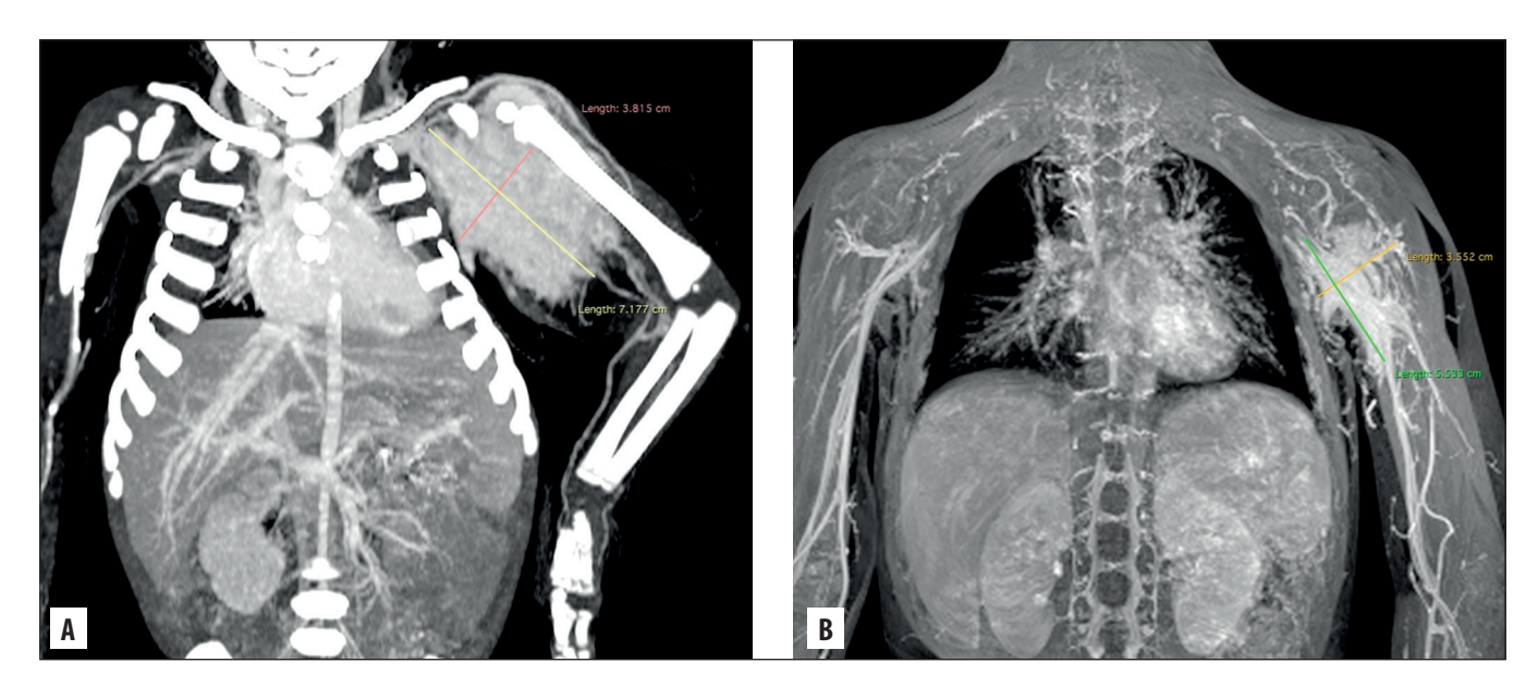
Fig. 2. Scan of the boy's body.

B. Follow-up studies show a partial regression of the tumor after 10 months of treatment