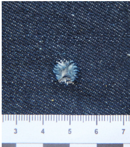
Fig. 5. Damage to denim fabric caused by a shot from Fort 12R at a distance of 25 cm.

Shots from the Fort 12R from a distance of 25 cm resulted in damage (minus fabric) to the jeans material (Fig. 5), square in shape, measuring 0.9x0.9 cm. The end ends of the threads are disheveled and thinned, directed in the direction of the bullet flight. There is no melting of the fibers. Around the damage, there is soot deposition at a distance of up to 6 cm, which is detected only by microscopy. Also, unburned powder particles of spherical and elongated shapes (5-10 pieces) were found around the damage.