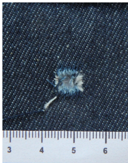
Fig. 6. Damage to denim fabric caused by a shot from Fort 12R at a distance of 50 cm.

Shots from Fort 12R from a distance of 50 cm result in damage (minus fabric) to the jeans material (Fig. 6), rectangular in shape, measuring 0.7x0.9 cm. The end ends of the threads are disheveled and thinned, directed in the direction of the bullet flight. There is no melting of the fibers. Also, single (2-3 pcs.) half-burned dust particles were found around the damage.