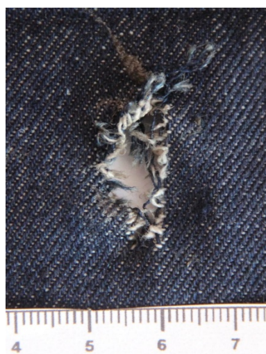
Fig.4. Damage to denim fabric caused by a shot at close range from Fort 12R.

Shots fired at close range from Fort 12R caused damage (minus fabric) to the jeans material (Fig. 4), round in shape, measuring from 0.9x0.9 cm to 0.8x1.0 cm. The edges of the damage are uneven, fringed, in the form of small flaps. The threads of the fabric base protrude into the lumen to different lengths, are disheveled, thinned, light gray and gray in color. The edges of the damage are slightly turned inward (in the direction of the bullet's flight). Around the damage there is a concentric deposition of soot of dark gray and blackish gray colors 0.2 cm wide with an outer diameter of up to 1.1 cm. Also, around the damage and on the threads inside the damage, single (2-4 pcs.) half-burnt and unburnt gunpowder particles of irregular oblong and hemispherical shape, gray in color, were found.