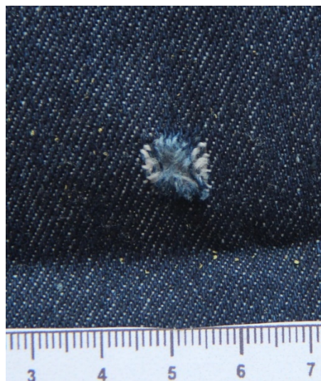
Fig. 2. Damage to denim fabric when shot with the AE790G1 from a distance of 25 cm.

Shots fired from the AE790G1 from a distance of 25 cm result in damage (minus fabric) to the denim material (Fig. 2), rectangular or square in shape, with dimensions ranging from 0.9x0.9 cm to 0.9x1.0 cm. The end ends of the threads are disheveled and thinned, directed in the direction of the bullet's flight. There is no melting of the fibers. Around the damage, there is soot deposition up to 7 cm, which is detectable only under microscopy. Also, unburned powder particles of spherical and elongated shapes were found around the damage (10 to 15 pieces).