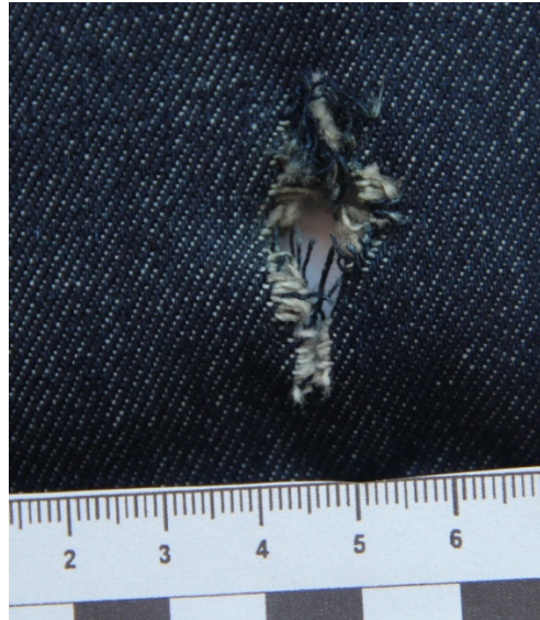
Fig.1. Damage to denim fabric caused by a point-blank shot from the AE790G1.

the direction of the bullet's flight). Around the damage there is a concentric deposition of soot of dark gray and blackish gray colors 0.4 cm wide with an outer diameter of up to 1.9 cm. Also, around the damage and on the threads inside the damage, single (1-2 pcs.) half-burnt and unburnt gunpowder particles of irregular oblong and hemispherical shape, gray in color were found.