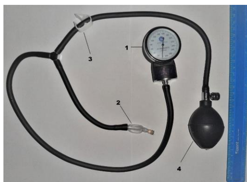
Fig. 1. Device for measuring the tone of the rectal sphincters. The components of the device are: 1– manometer (mm Hg); 2 – sensitive cuff, which is inserted into the rectum; 3 – clamp; 4 – pressure blower.

in the circuit and a sensitive cuff. All modules of the device were connected by sealed rubber tubes (Fig. 1).