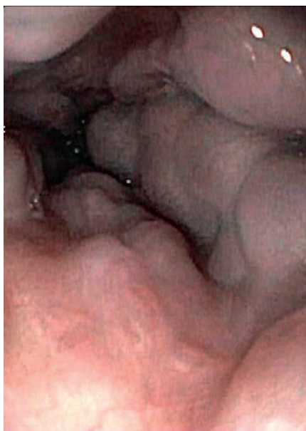
Fig. 1. Esophageal varices grade III before EVL.