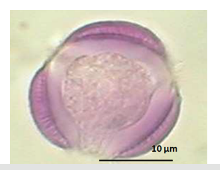
Fig. 3 Artemisia pollen grain.