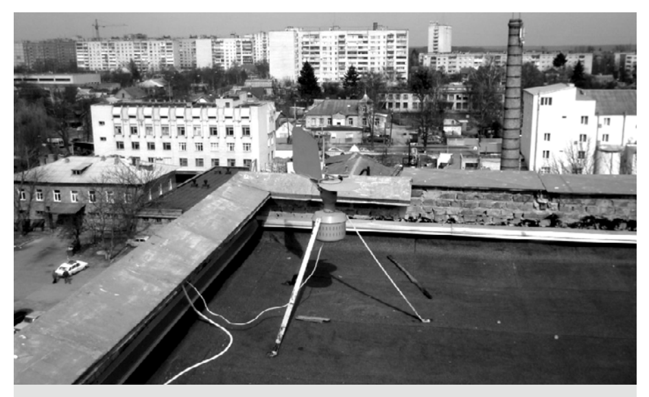
Fig. 1 The Burkard sampler located on the roof of the Chemistry Building of the National Pirogov Memorial Medical University, Vinnytsya, Ukraine.

The research was performed in 2012–2014 in Vinnytsya, Ukraine (49°23'30" N, 28°46'82" E, 235 m a.s.l.). The observation period each year was from 1st May to 31st October; samples were collected daily. In total, 552 air samples were taken. Aerobiological monitoring of pollen concentrations employed a Burkard pollen trap. The device was located on the roof of the chemistry building of the National Pirogov Memorial Medical University, Vinnytsya at a height of 25 m, according to the standard rules of the European Aeroallergen Network [6,7] (Fig. 1).