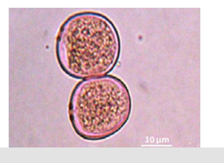
Fig. 4 Poaceae pollen.

Ambrosia (Asteraceae) pollen is distinguished from the pollen grains of other members of the Asteraceae by the size of the spikes, the structure of the colpe, and the thickness of the exine (Fig. 2). The pollen grains of Ambrosia are 15–24 \mu m in diameter, somewhat flattened to nearly spherical (isopolar), the exine is thin and the spines are short.